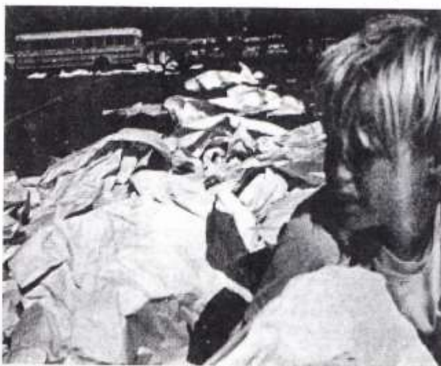
Newsprint fun at Isla Vista Elementary School project, College of Creative Studies, University of California, Santa Barbara. Children used the enormous rolls for sliding, folding, hiding, painting, mattress-building, bouncing, etc. University faculty students provided with the rolls mostly stood and stared at them, expecting others to be actively inventive.

that need immediate transformation. This holds true even in innovative school districts that have extended or abolished the classroom walls. They should simply give top priority to the environment of the new classroom or playground, whether it be a mobile unit, exploratory museum, ecological reserve or study center, or wherever the children may be. 12 Ten years of vest-pocket parks, concrete plazas and adventure