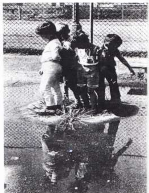
Loose parts at work - water, ripples, reflections, slush, floating and living objects. Many curriculum units are based on experiments with water; here is the quickest, cheapest way to introduce variables in an asphalt/chain-link environment.

has existed for some years: the methodology, involving what is called the "discovery method," has been developed by a group of researchers working in curriculum innovation for elementary schools. The obvious pattern of behaviour that can be identified here is a self-instructional pattern, namely, that children learn most readily and easily in a laboratory-type environment where they can experiment, enjoy and find out things for themselves.