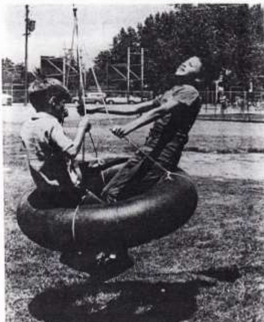
Pendulums and bouncers at the Valley Oak Elementary School project, University of California, Davis. Children love to oscillate vertically on bouncers and can experiment with weight, period, orbit, and many other concepts.

Several groups in the U.S. have been experimenting with this process with children, by far the most comprehensive being the Environmental Science Center in Minnesota. 9 A complete bibliography of publications and curriculum materials has recently been compiled for a new course at the University of California, Davis. 10 Environmental education, (as opposed to conservation education, or the understanding of preservation of the non-man-made environment) means the total study of the ecosystem, i.e.: man, his institutions, and his structural, chemical, etc., additions, included. The subject of human ecology, our values and concepts, the environmental alternatives and choices open to us, in the fullest sense, has recently become