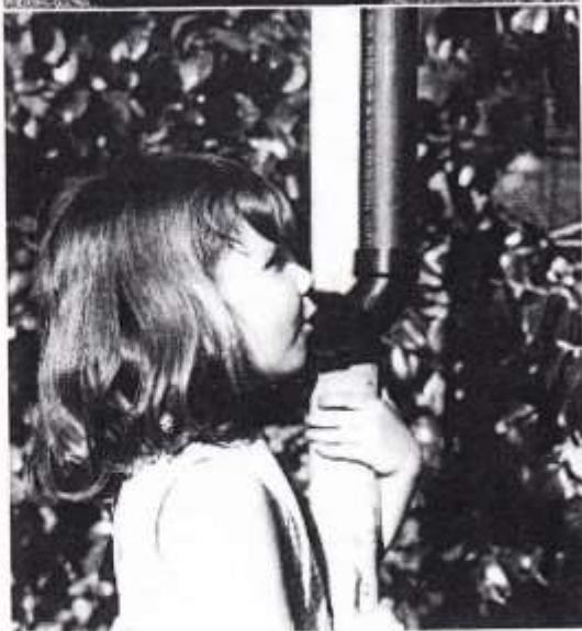
Voice tube made from PVC tube and brass snap-strainer connects three levels of the Hide Away, Human Resources Centre, Pontiac, Michigan. Voice tube adds a variables to any structure, allows experiments in communication, increases perception of space and volume.